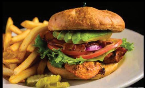
Cali Chicken Sandwich

(American, cheddar, provolone, pepper jack or Swiss)