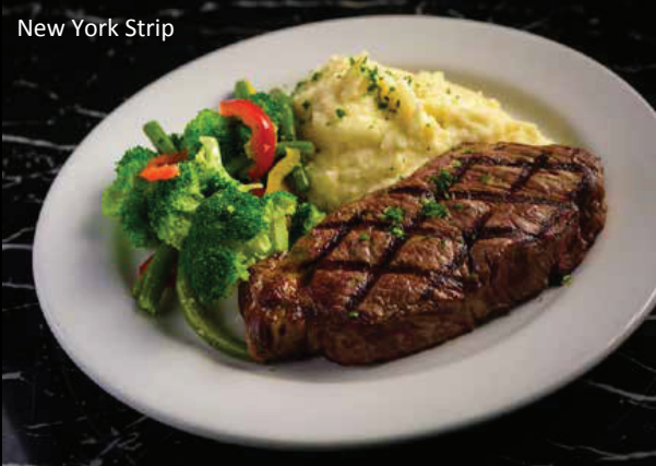
New York Strip

8 oz. fire-grilled New York Strip hand-seasoned with fresh cracked pepper. Served with pesto mashed potatoes and steamed broccoli. 17.99