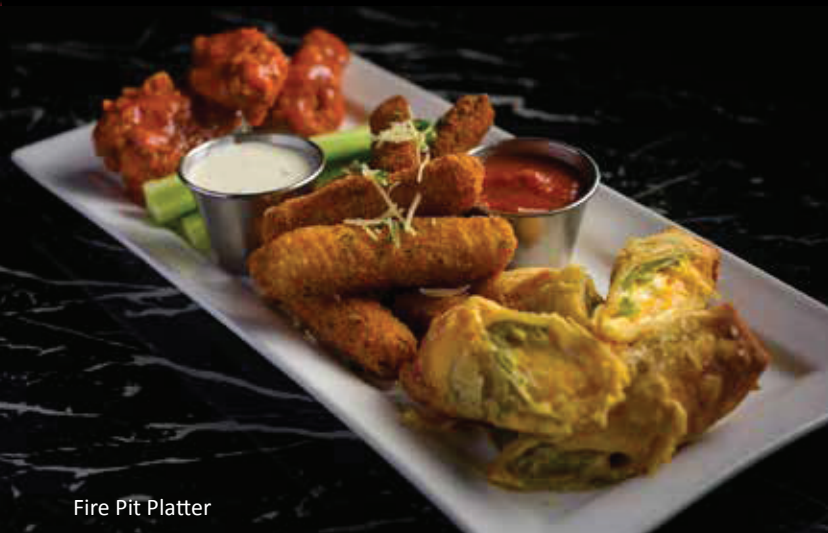
Fire Pit Platter

Breaded chicken tenders tossed in your choice of sauce, served with celery & ranch dipping sauce. 10.99