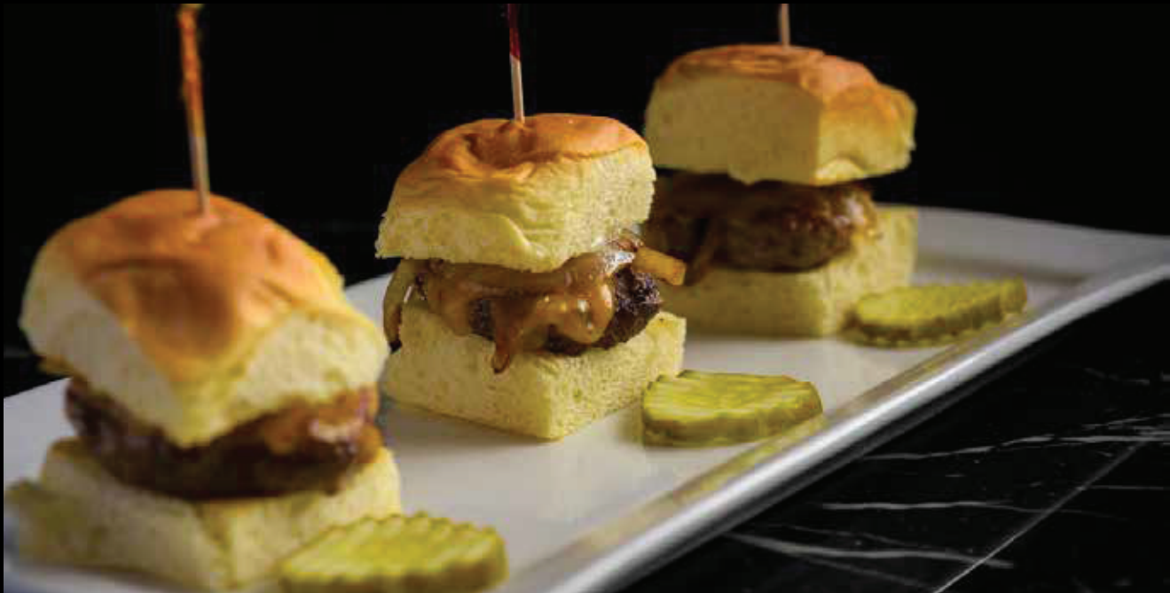
Original Firehouse Sliders

CRISPY CHICKEN (3) Crispy chicken patty covered in buffalo sauce with lettuce & pickles.