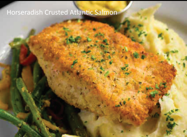
Horseradish Crusted Atlantic Salmon

Original Salmon smothered in our spicy housemade seasoning.