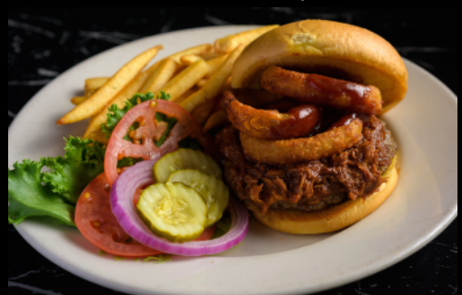
Big Texas Burger