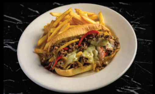
Philly Steak Sandwich