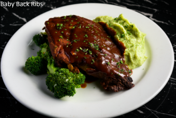
Baby Back Ribs

Topped with BBQ sauce, served with broccoli & garlic mashed potatoes. Half 18.99 • Full 24.99